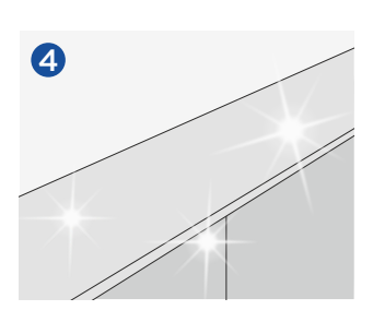
Wipe away with a clean cloth. Leave the surface to air dry.