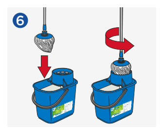
Clean the dirty mop head in the bucket and repeat the previous steps until the floor is clean. Allow to air dry for a streak-free finish.