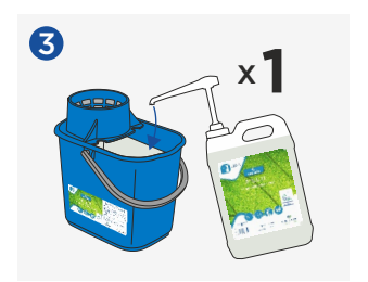
Dispense 1 pump (30ml) of GREEN'R Multi into the bucket.