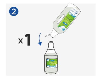
Add 1 shot (20ml) of GREEN'R Multi.