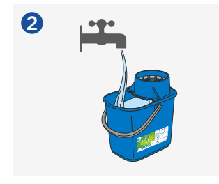
Fill an empty bucket with 5 litres of clean water.