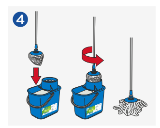
Immerse the clean mop head into the bucket of GREEN'R Multi solution and wring out the mop thoroughly.