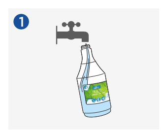
Fill an empty trigger bottle with clean water.