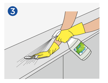
Spray diluted GREEN'r Multi onto the area to be cleaned and work into the surface with a cloth.