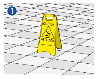
Place a wet floor sign in the area to be cleaned.