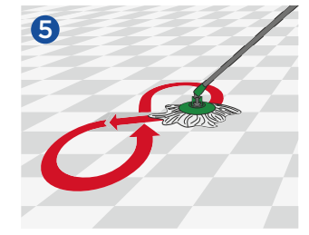
Apply the mop to the floor and wipe in a figure of 8 motion, working the mop side to side.