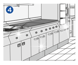
Wipe away with a clean cloth. For food preparation areas, rinse thoroughly with clean water. Leave the surface to air dry.

For Health & Safety information, please scan the QR code provided.