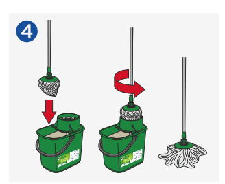
Immerse the clean mop head into the bucket of GREEN'R Indus solution and wring out the mop thoroughly.