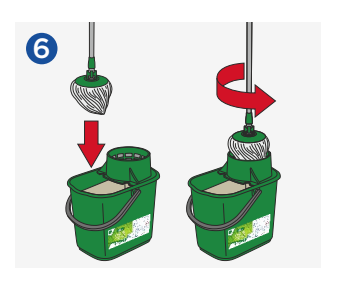
Clean the dirty mop head in the bucket and repeat the previous steps until the floor is clean. Allow to air dry for a streak-free finish.