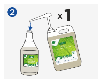
Add 1 shot (30ml) of GREEN'R Indus.