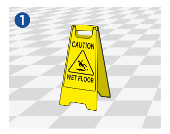
Place a wet floor sign in the area to be cleaned.