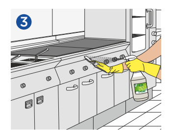
Spray diluted GREEN'R Indus onto the area to be cleaned and work into the surface with a cloth.