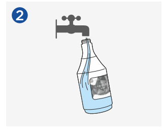
Fill an empty trigger bottle with clean water.