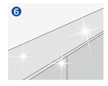
Wipe away with a clean cloth. For food preparation areas, rinse thoroughly with clean water. Leave the surface to air dry.