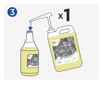
Add 1 shot (30ml) of Mida Lufragerm Plus.