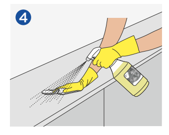
DISINFECT: Cover the surface with diluted Mida Lufragerm Plus.